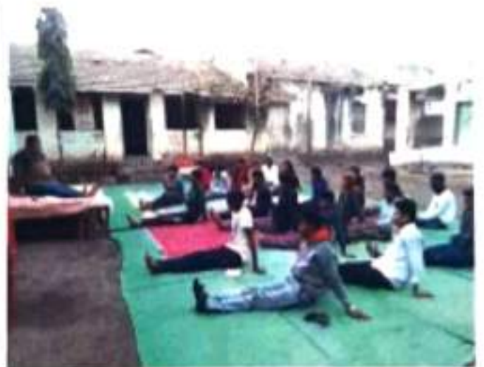
2017 Yoga day at MNG science college